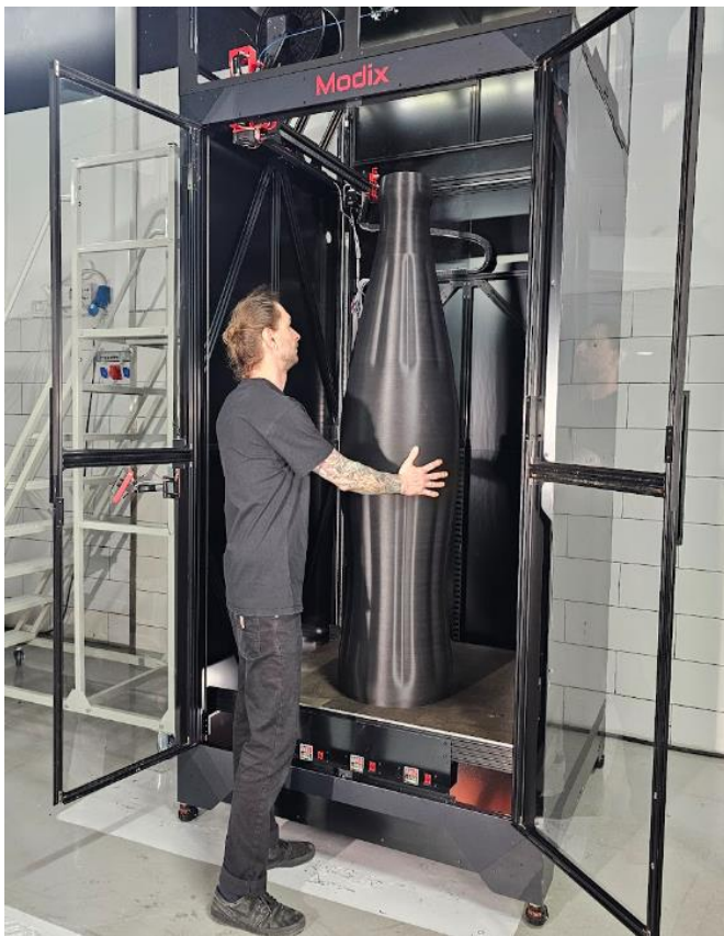
2 Meter tall, 17.5 hours 1.2 mm layer, 2 walls, 8.2 KG

Warranty: 12 months (extendable) of and lifetime support